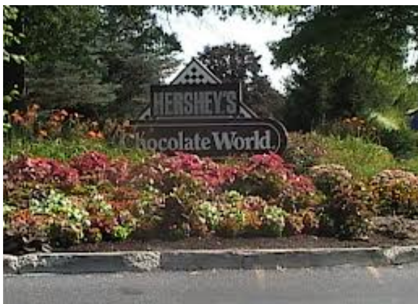
Hershey's Chocolate Company

Milton Hershey is remembered as someone who built an entire city and helped people get jobs. He is remembered for someone who made a school for children who did not have families. He is someone who made a medical center to help those who are sick and someone who made that chocolate, that yummy chocolate that most of us throughout the world enjoy.